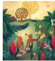
ILLUSTRATION 3: Journey to Hope EPISODE 3 "The Fall," showing Adam and Eve in the Garden of Eden before being tempted by the serpent.