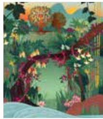
ILLUSTRATION 2: Journey to Hope EPISODE 2 "Creation," showing Adam in the Garden of Eden.