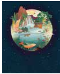
ILLUSTRATION 1: Journey to Hope EPISODE 2 "Creation," showing how God created the world from the book of Genesis.